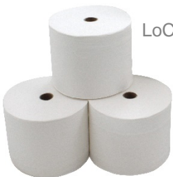
LoCor® Bath Tissue